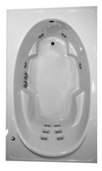
72"x42"x23" Shipping weight - 200lbs

Operating Gallons - 55 gal. reg. usage 95 gal. upper body usage Upper body jets can be shut down for operation at a lower level